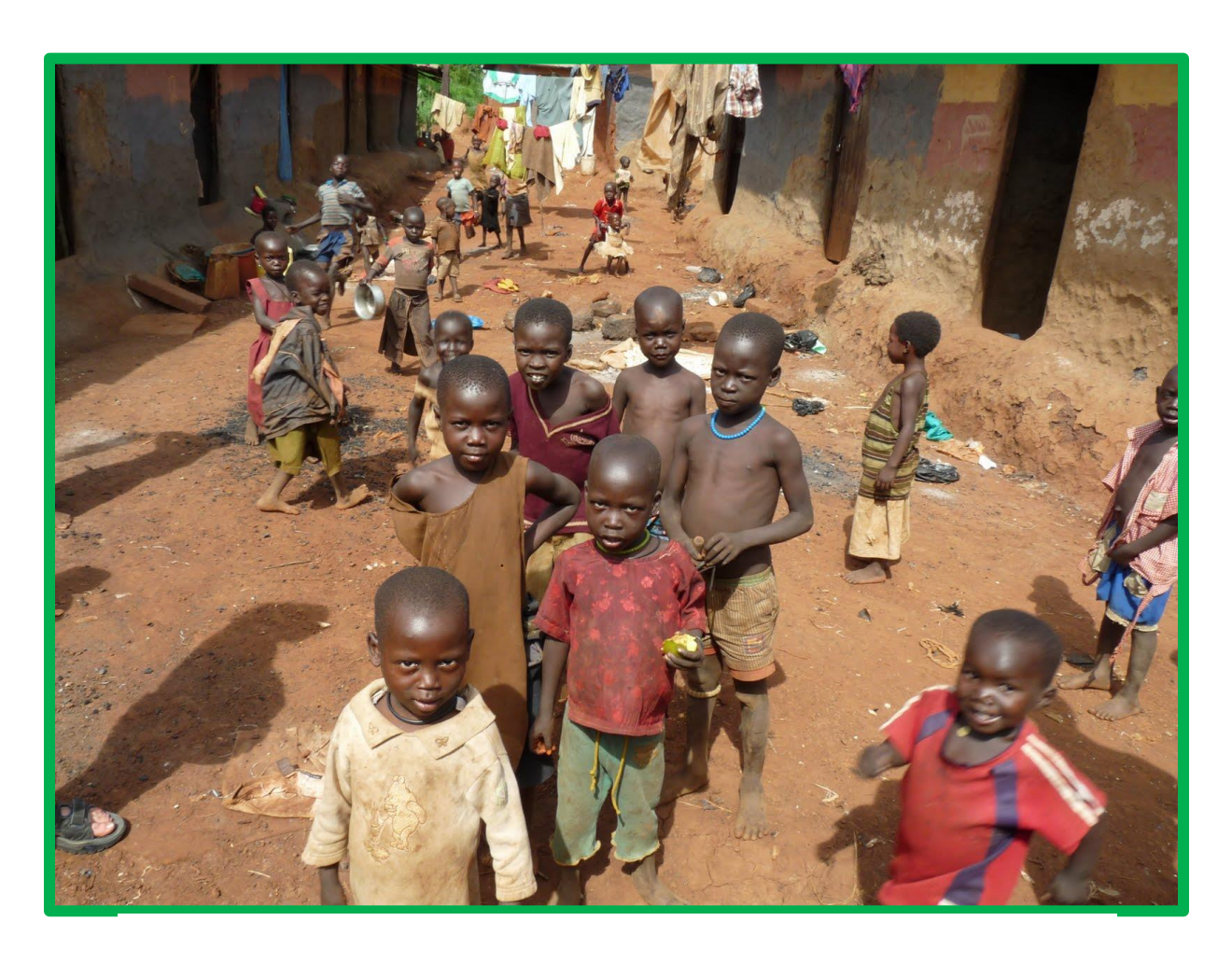
Introduction to Uganda and Jinga