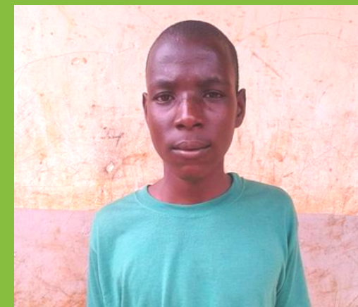
Chairperson of Children's Council for S.A.L.V.E. International

Before being entrusted with this role, I have been a member on this council for two consecutive years.