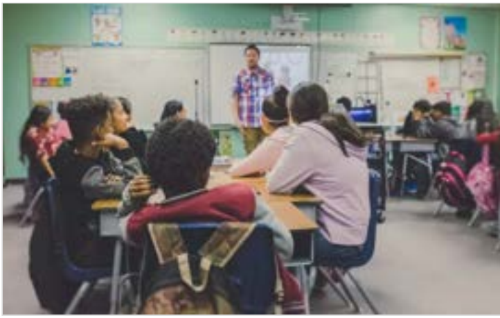
yes they should teach them so that they can be aware of the dangers of bullying. – ANONYMOUS